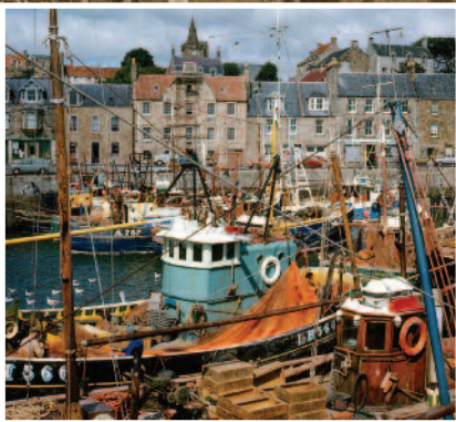
Pittenweem harbour in the early 1970s, a thriving fishing port.