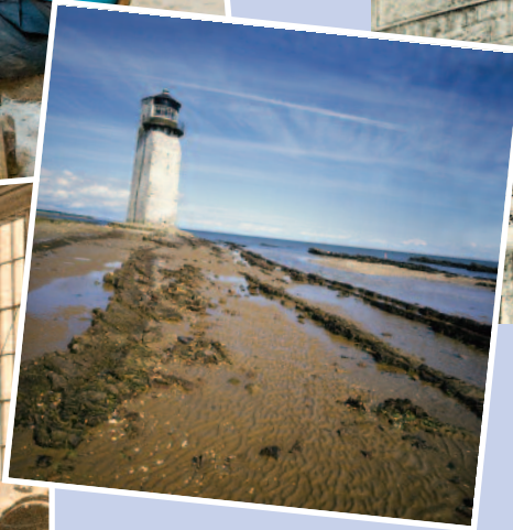
Left: Southern Ness Lighthouse has stood idle for more than eighty years.