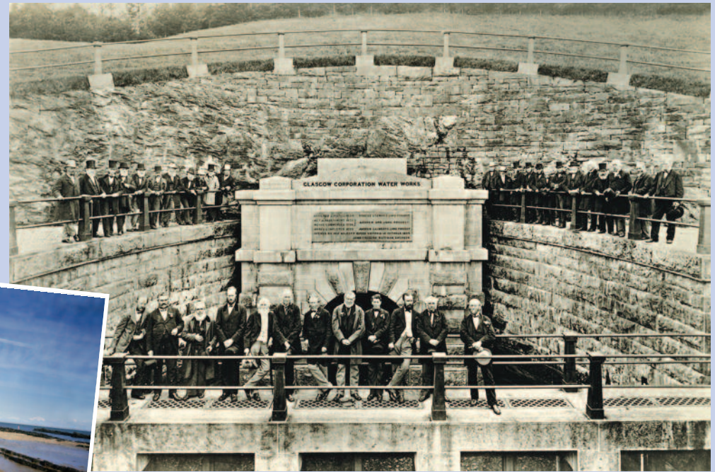
Above: Glasgow City Council's Water Committee and Water Commissioners, photographed by Thomas Annan in 1876 after inspecting the extended water works at Loch Katrine.